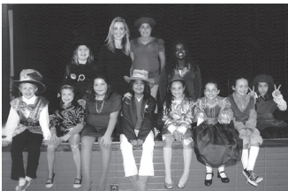
Visitation School Students-Cast of "WICKED."