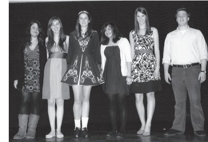
A fabulous group of young entertainers.